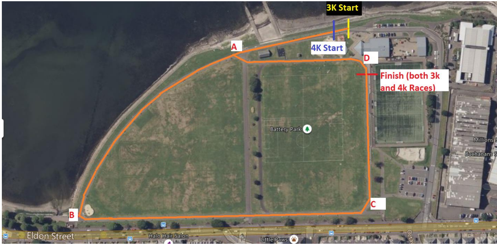
Map 5 – U13 & U15 = 3k Course. U17 = 4k Course