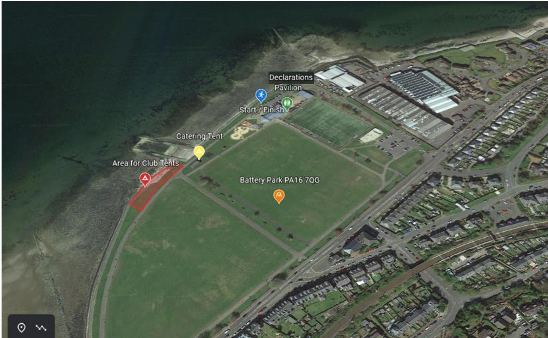
Map 1 Event Overview Map