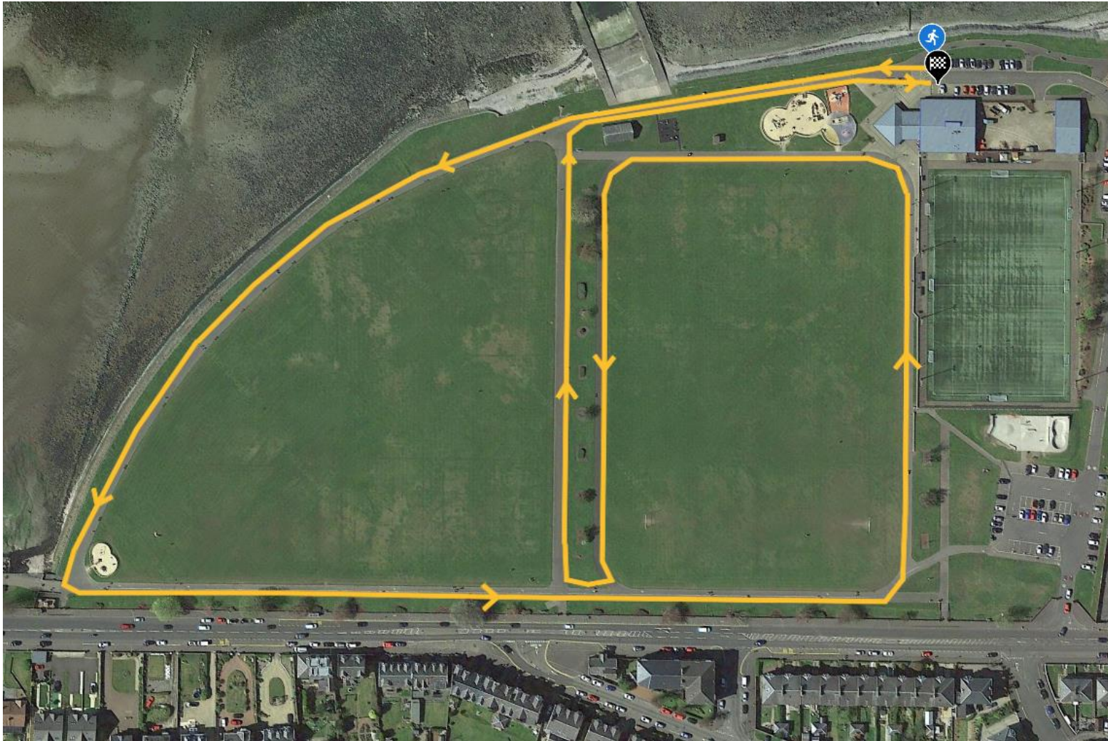
Map 4 - U11 1.6km extended loop of Battery Park