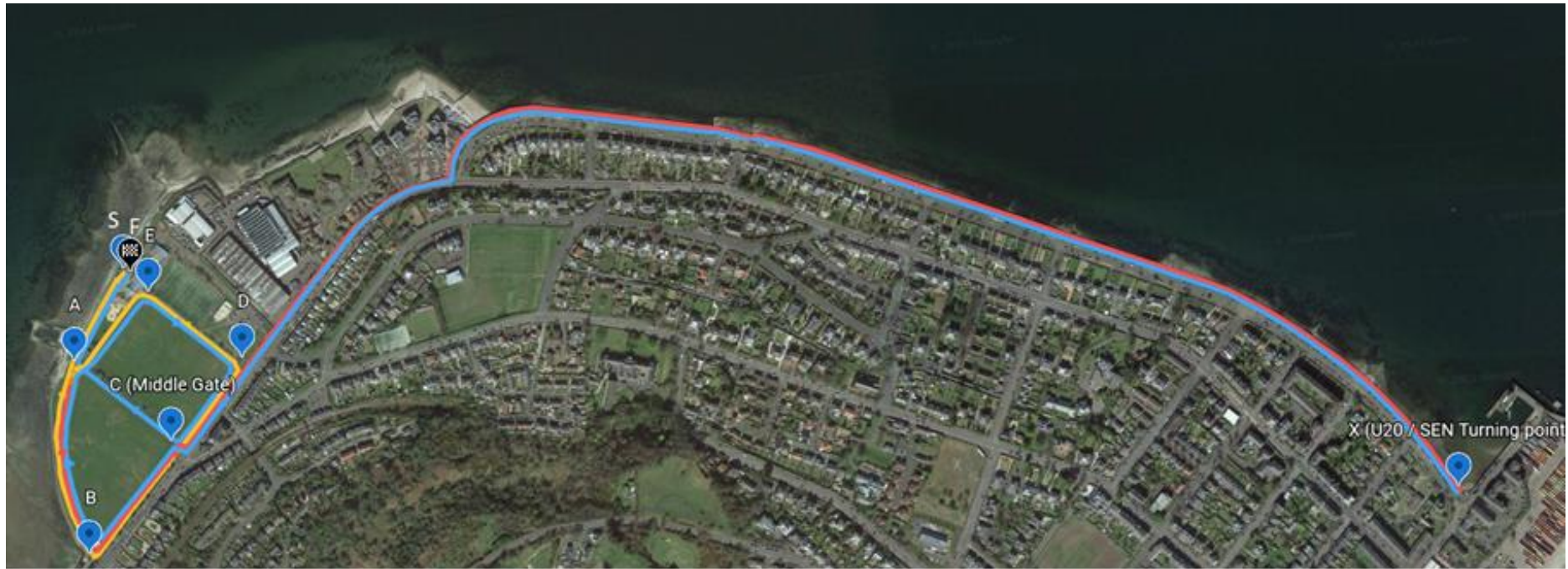
Map 2 - U20 / SEN Full Map.